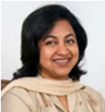
R. RADIKAA SARATHKUMAR